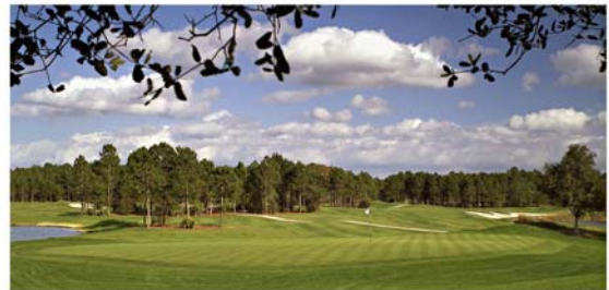
Slammer & Squire, Number 17