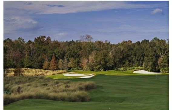
Slammer & Squire, Number 14