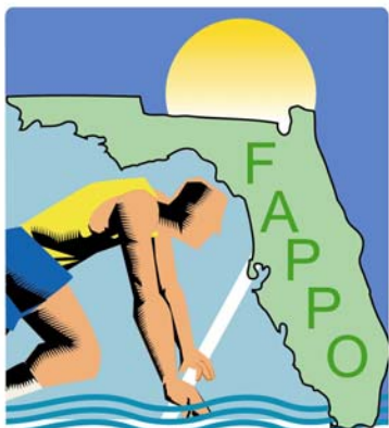
Going The Extra Mile