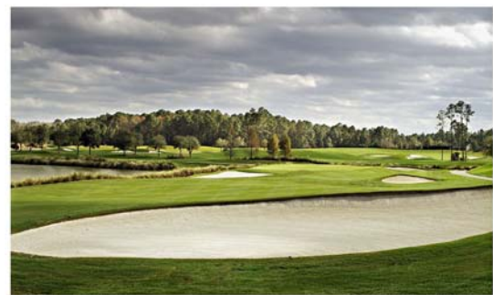
Slammer & Squire - Number 18