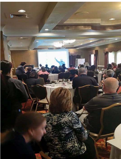
Keynote Speaker captivating members at the 2015 Fall Workshop

In addition to annual events, FAPPO hosts NIGP 3-day core classes at subsidized rates. The host facilitator receives a complimentary registration for attending the class.